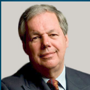
RT. HON SIR TONY BALDRY CHAIRMAN OF THE BOARD